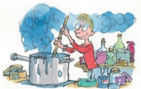
"The rule would be, whatever he saw, if it was runny or powdery or gooey, in it went."